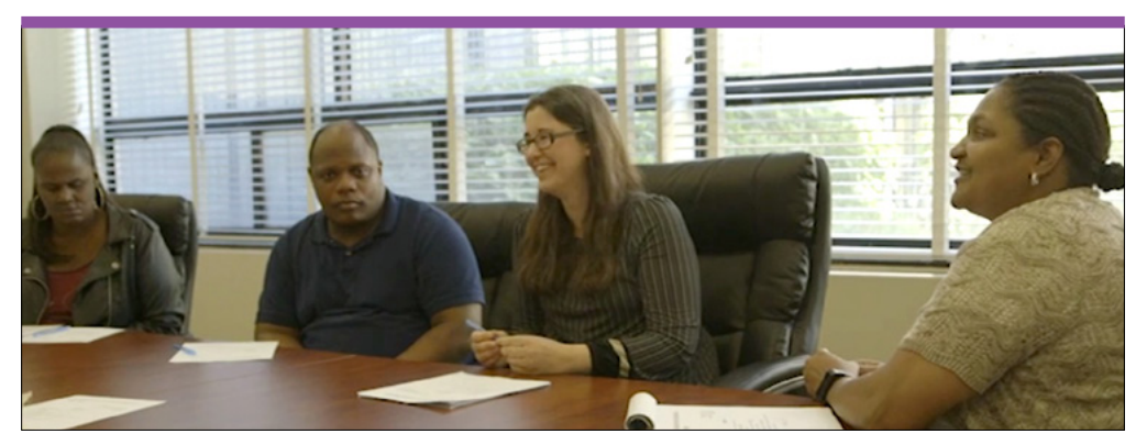
Leadership Advisory Board Meeting

The Chicago Health Disparities Center at the Illinois Institute of Technology (IIT) is committed to reducing physical health disparities for racial and ethnic minorities with mental illness. Individuals with lived experience collaborate with researchers on a variety of projects. Roles for individuals with lived experience include Leadership Advisory Board members, peer navigators, research assistants, and research leaders.